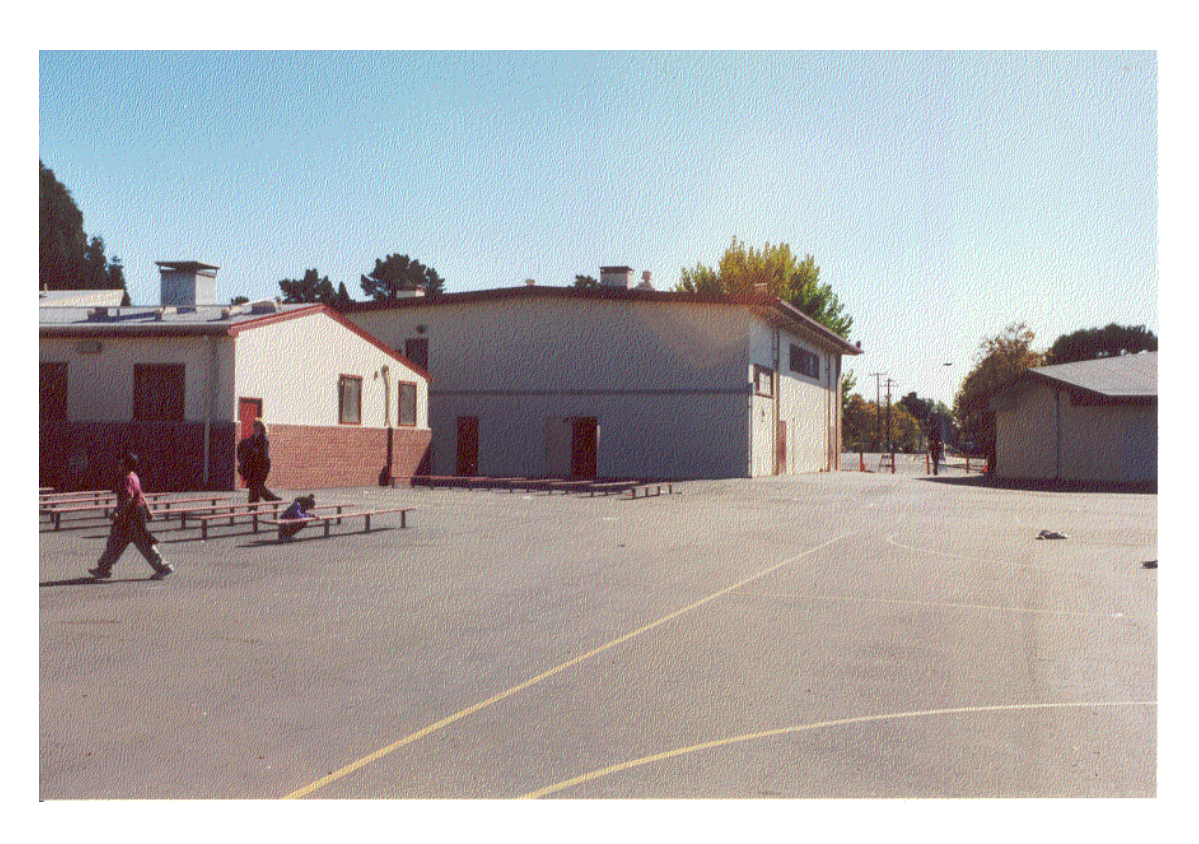
Figure 10: Unit B (multipurpose building) north face