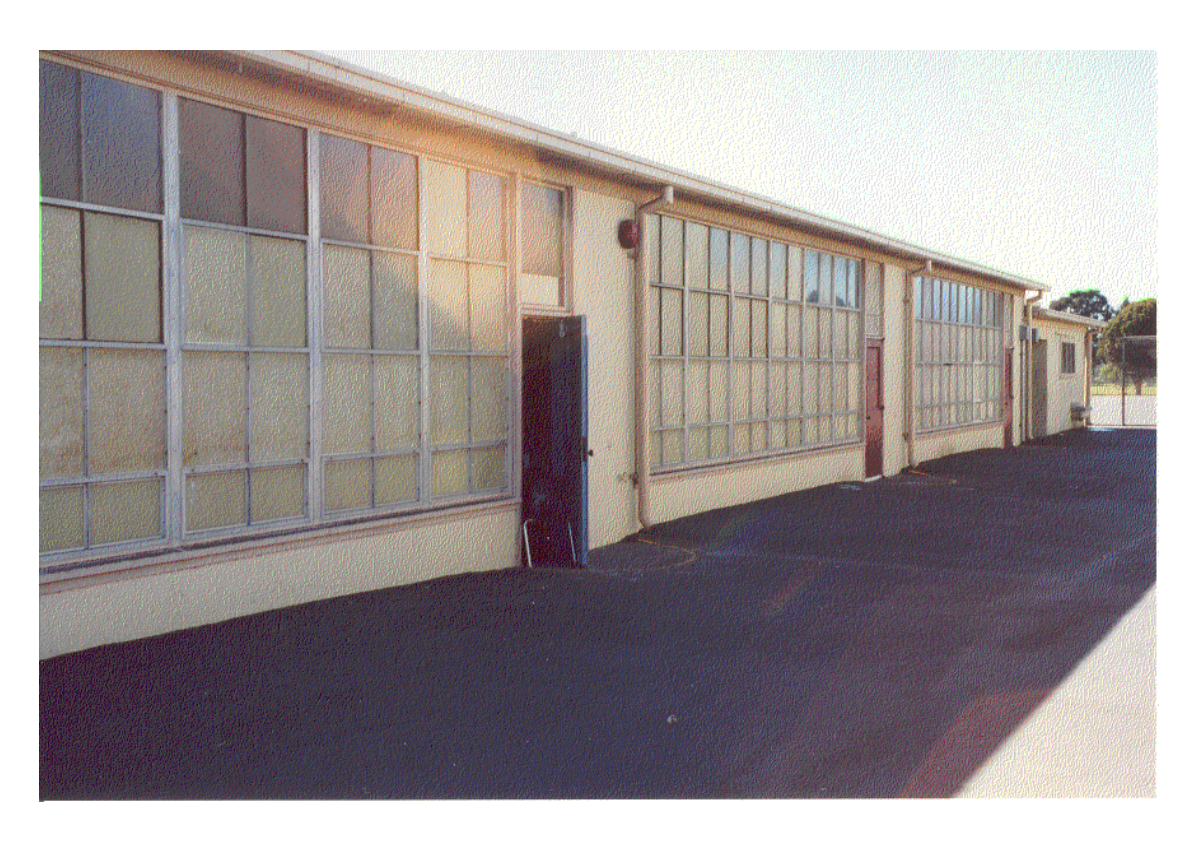
Figure 6: Unit C (classroom building) north face