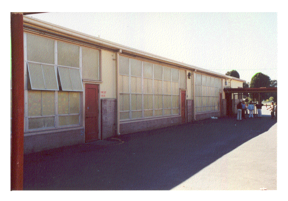
Figure 4: Unit D (classroom buildings) north face