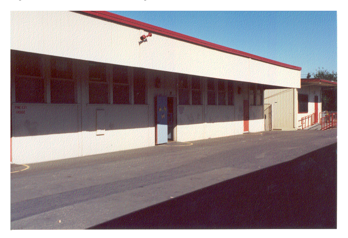
Figure 7: Unit E (classroom building) south face