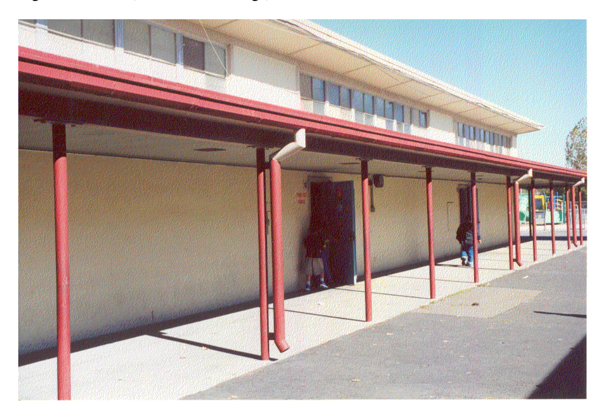
Figure 5: Unit C (classroom building) south face