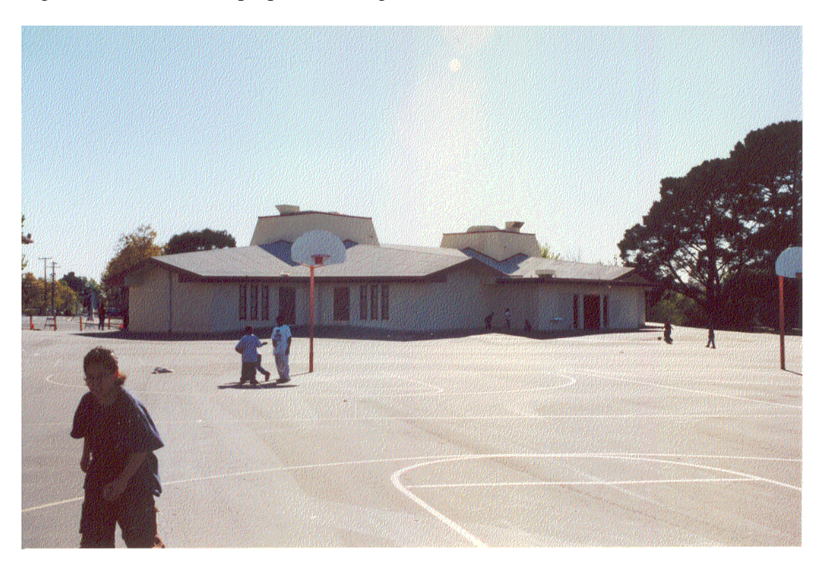
Figure 11: Unit A (classroom building) north face