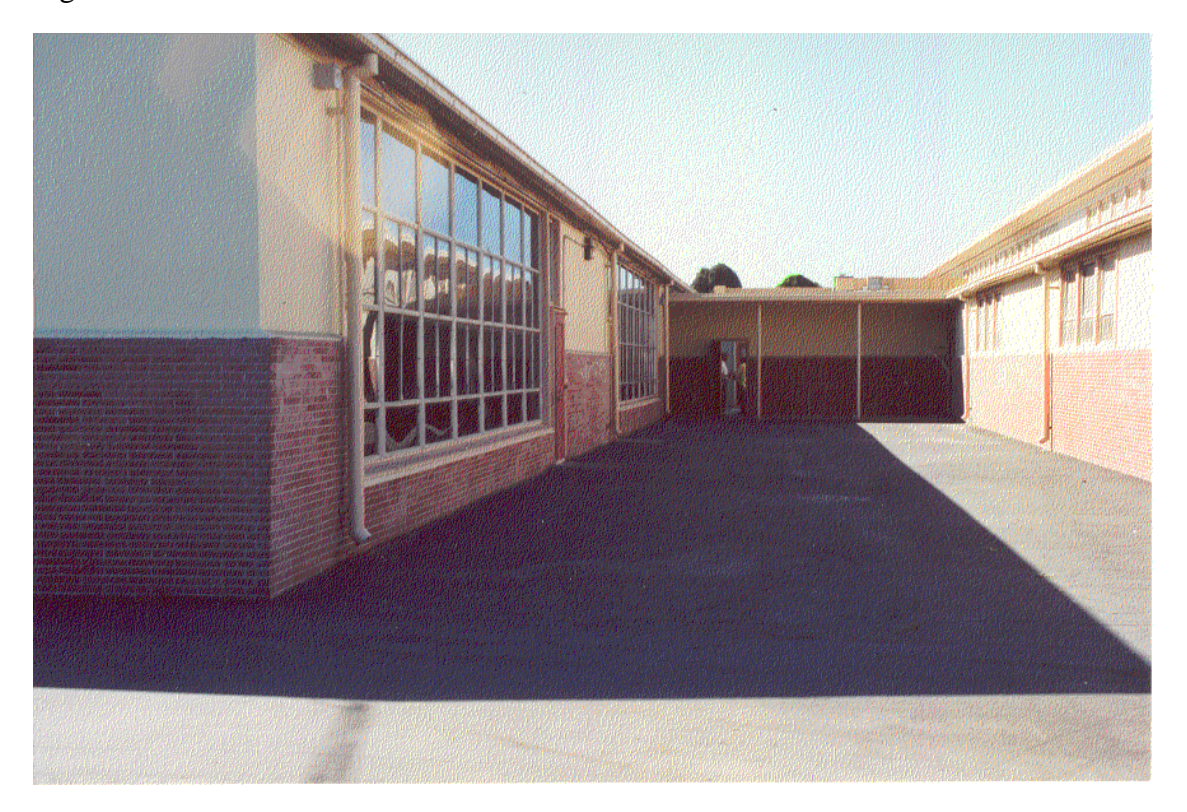
Figure 3: Unit D (classroom buildings) east face