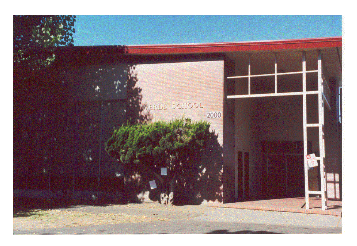
Figure 2: Main Entrance